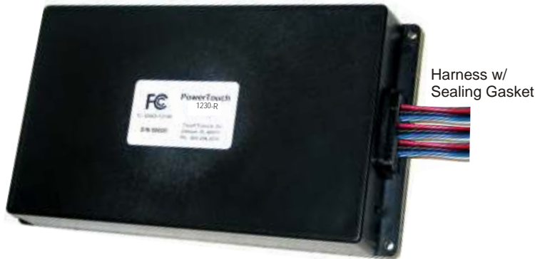
Harness w/ Sealing Gasket