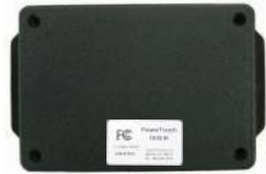
P1500 Series Standard Unsealed 5 1/4" x 3"