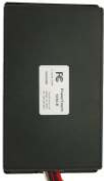
P1200 Series Standard Seal - Dust, Moisture Super Seal - Hi Pressure Wash 9 1/4" x 5 1/4"