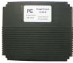
P1000 Series Standard Unsealed 6 1/2" x 5 1/2"