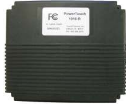
P1000 Series Standard Enclosure 6 1/2" x 5 1/2"