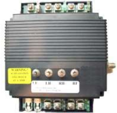
P919HD Series Standard Unsealed 5 1/4" x 3"