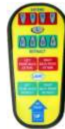
P919HD-TXS Standard Unsealed 2 1/4" x 2"